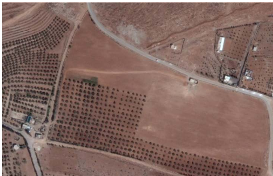
Figure A1. Al Soujah area. Vineyard surrounded by olive trees. Located west of Yafour.

The study areas are presented in Figures A1 and A2. They are Al Soujah (Yafour) area, located 23 km west of Damascus, and the Al-Hamah area located 14 km north west of Damascus respectively.