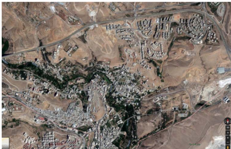
Figure A2. Al Hamah area, a river crosses the area.

Table A1 gives the list of the pesticides, their retention times, the transitions used for quantitation and confirmation together with the optimised collision energies (CE) and the corresponding retention time windows in the multiple reaction monitoring (MRM) acquisition method obtained using a gas chromatograph coupled to tandem mass spectrometry (GC-MS/MS).